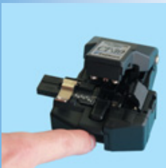
1. Blade setting